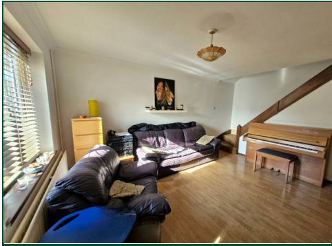
GROUND FLOOR 319 sq.ft. (29.6 sq.m.) approx.